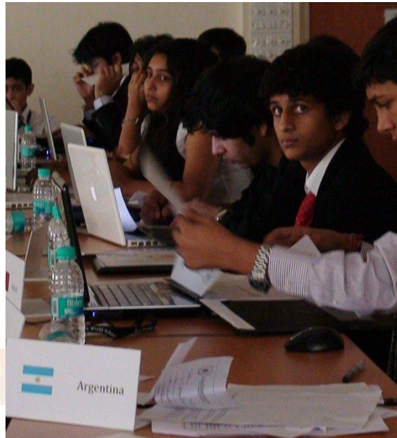
Committee Session at ÉMUN 2009