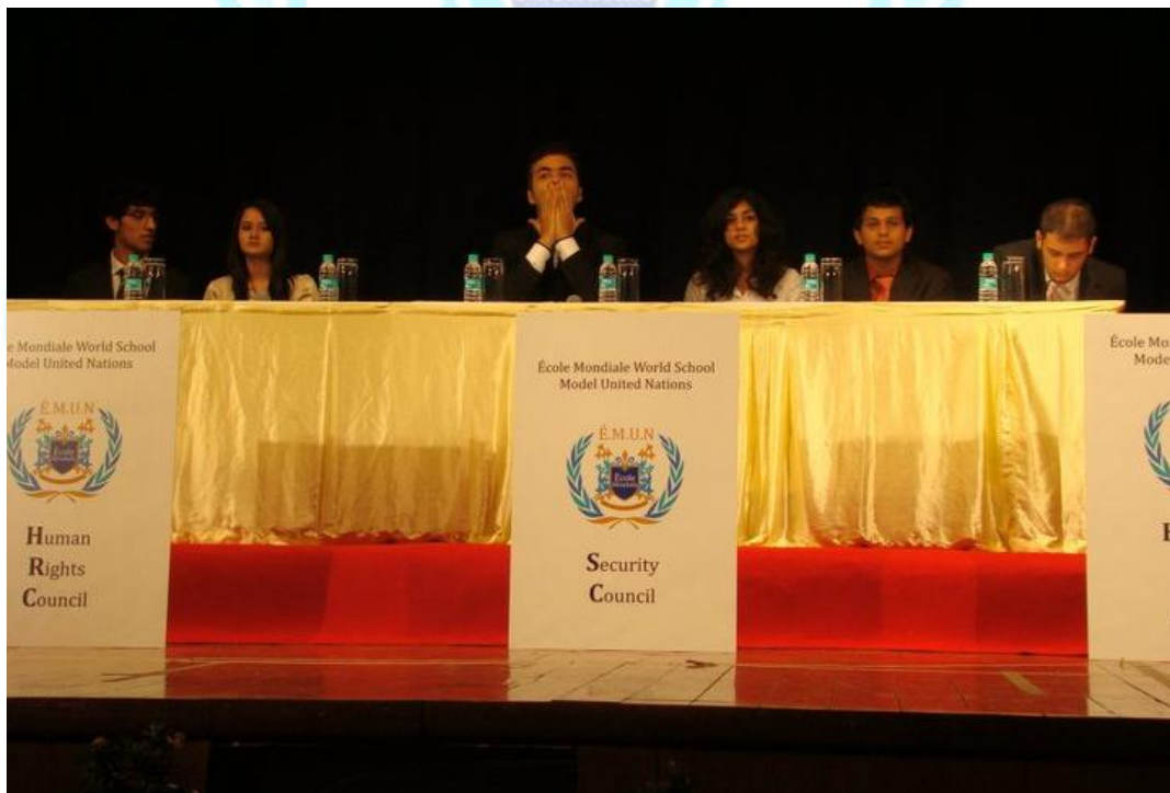
Karun Johar, Guest of Honor of ÉMUN 2009