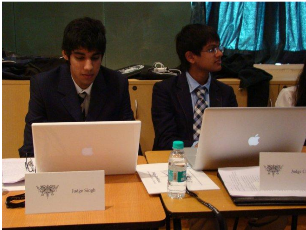
The International Court of Justice