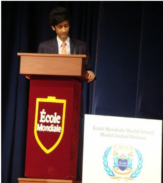
Secretary General's address at the Opening Ceremony, ÉMUN 2009