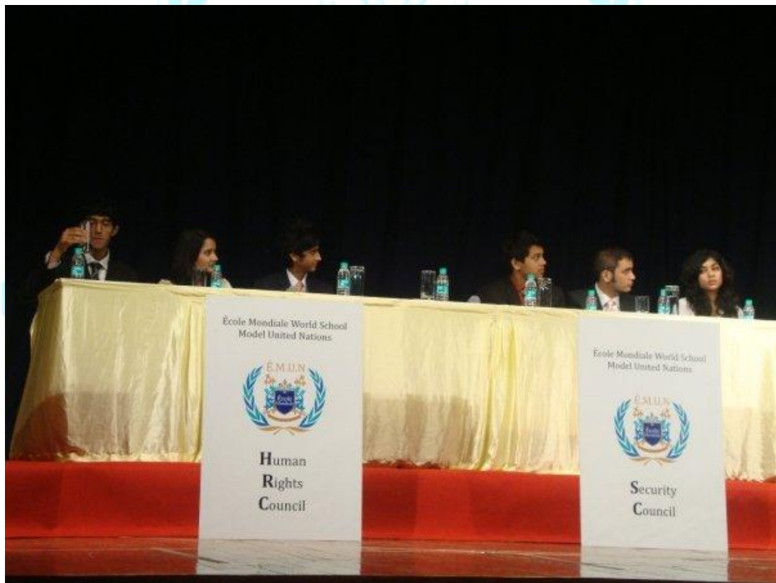
Committee Heads at the opening ceremony, ÉMUN 2009